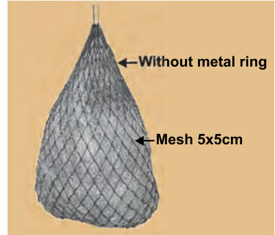
NO.1891 HAY NET Small mesh 5x5cm, extra strong water resistant synthetic rope with tiny openings, without metal ring. The horse will not swallow the metal rings. Length:110cm(43") Color:red(1), blue(2), green(3), black(4) 50/Box