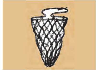
NO.1820 COTTON ROPE HAY RACK Strong knotted cotton cord 25/Box