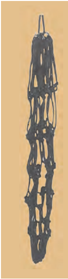
NO.1825 PLASTIC HAY RACK Medium cord Length:105cm(42") Color:red(1),blue(2),green(3), black(4) 50/Box