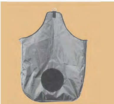
NO.1813 FEED BAG Heavy duty nylon good for one of each horse to feed. Size:L 50mmxW 50mmxdept 18mm Color:dark blue(9) 50/Box