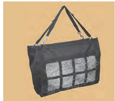
NO.1890 HAY BAG Easy to fill with extra large top. Holds 2-3 flakes of hay. Top flap closes securely, made of heavy duty nylon water proof. 25cm(10") wide mesh bottom. Nylon web squares allow the horse to pull small amounts of hay at a time. Adjustable hand straps with snap. Size:61cm(24")Lx25cm(10")Wx52cm(9-1/2") Color:black(4) 20/Box