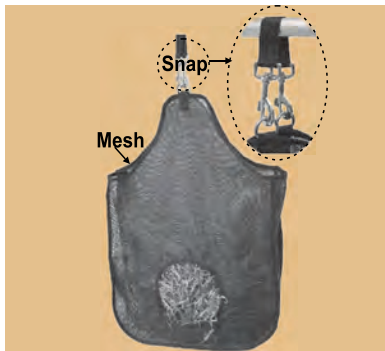
NO.1867 MESH HAY BAG Woven polyester yarns for strength and durability. Breathable mesh allows air to circulate, preventing moisture build-up and mold. Hangs securely with snap in barn or trailer. 18cm(7") diameter hole. 58cm(23")H x 50cm(20")W x 16.5cm(6-1/2")D. Color:black(4) 50/Box